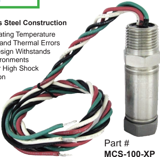
Part # MCS-100-XP